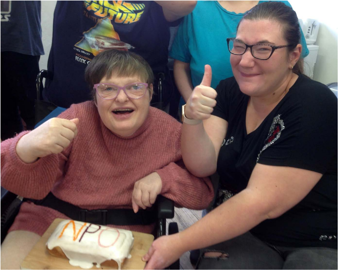
Celebrating with cake – achieving Arts Council England NPO status, November 2022.

“DIY Theatre has proved its sustainability over a 25 year period, establishing cutting edge theatre practice led by disabled practitioners and performers. The company has led on Arts Award for special schools and established ground breaking work around disabled people as leaders, valuing lived experience way ahead of any agenda that espoused this way of working. Artistically the quality of the products created is very high with strong production values.”