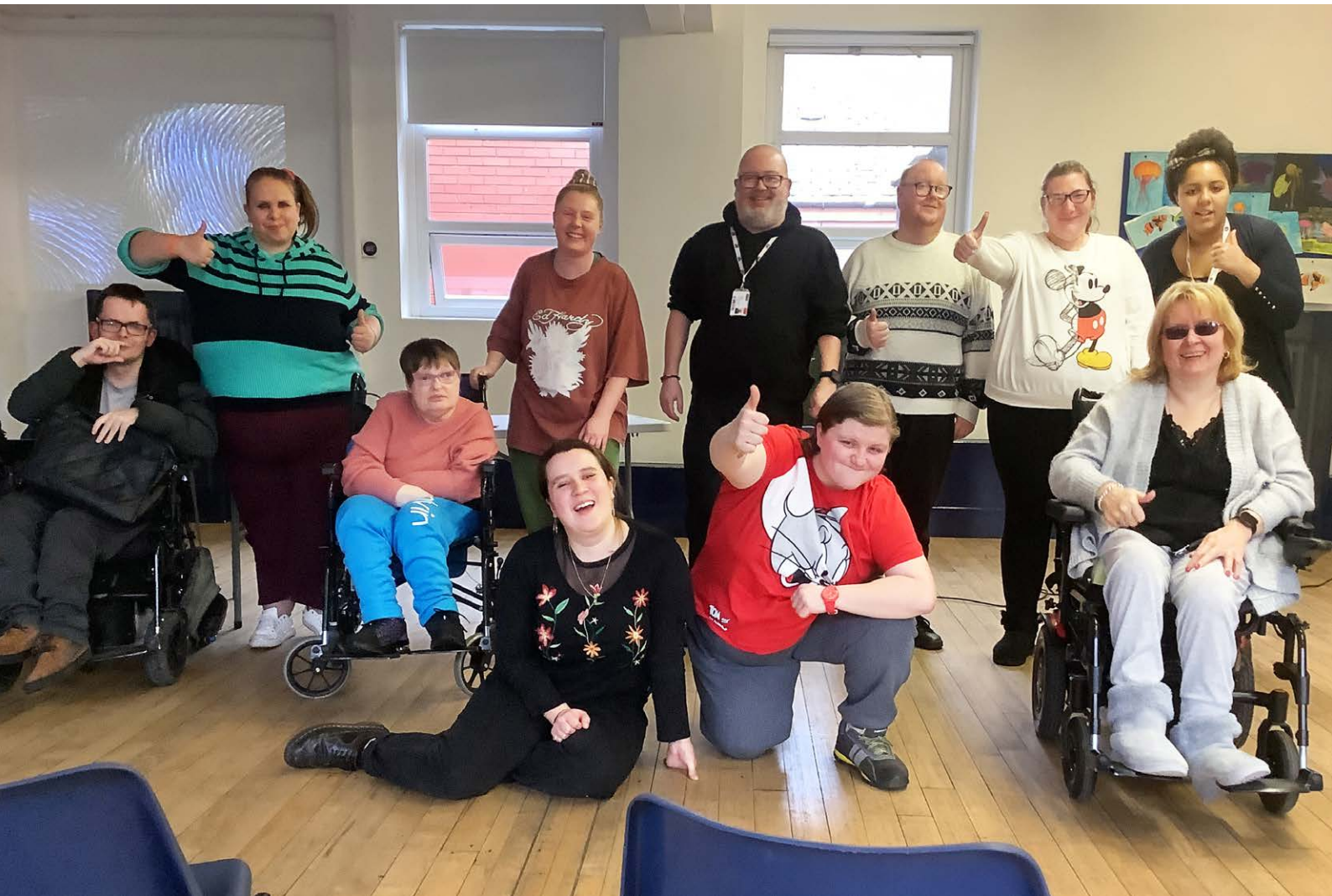
Safeguarding young people training for DIY Gamechangers, February 2023