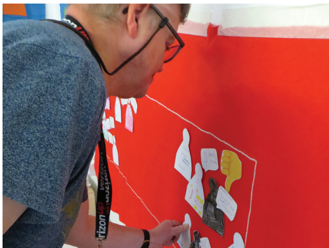
DIY's Board deciding on their priorities for the coming years.

We have been creating accessible and thought-provoking theatre and creative projects for 25 years!